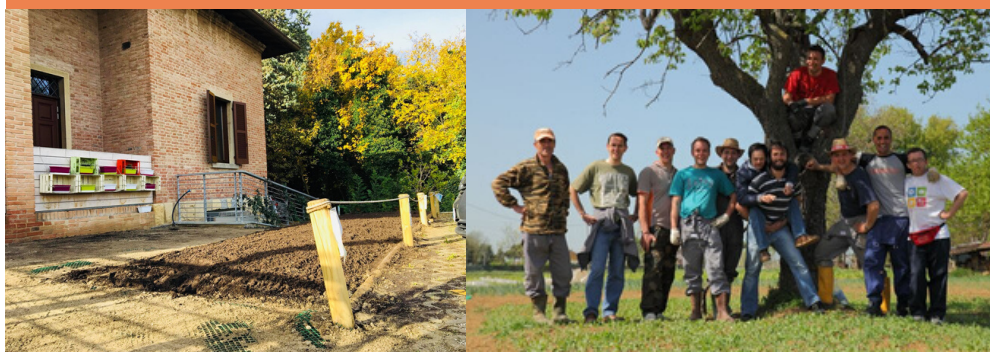
The preparation for the plants