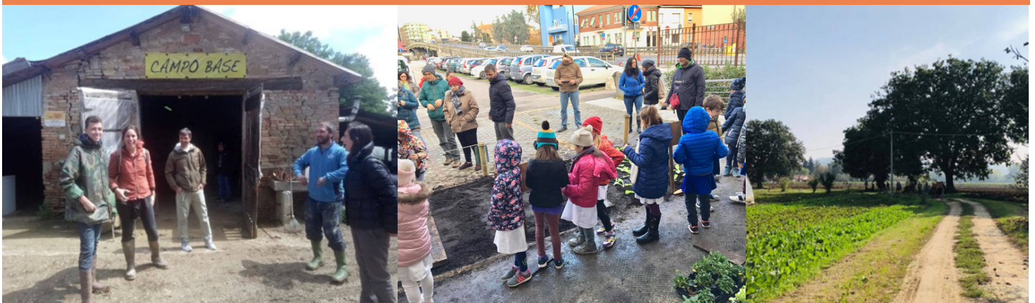
One of the buildings